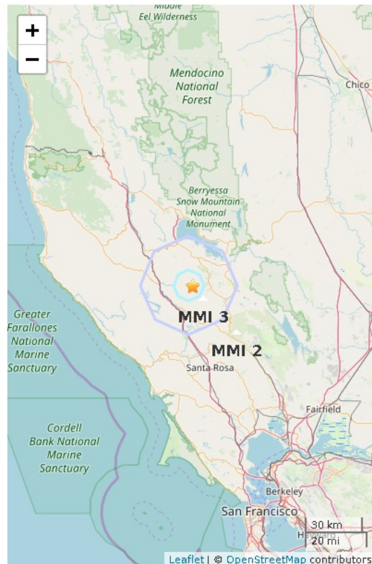
Figure 2. Polygons show shaking intensity contours for the final ShakeAlert. Shaking of intensity 3 or less often is not felt. Star shows the regional network epicenter.