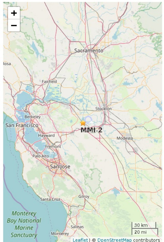
Figure 2. Polygons show shaking intensity contours for the final ShakeAlert. Shaking of intensity 3 or less often is not felt. Star shows the regional network epicenter.