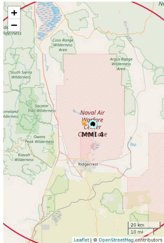
Figure 1. ShakeAlert earthquake location (black dot). Star is regional network epicenter. Polygon is the predicted outer range for felt ground motion (MMI 2). Red circle is front of peak shaking when the alert was released. Shaking takes 10 s to expand from circle to circle.

To learn more about ShakeAlert, visit www.shakealert.org/FAQ