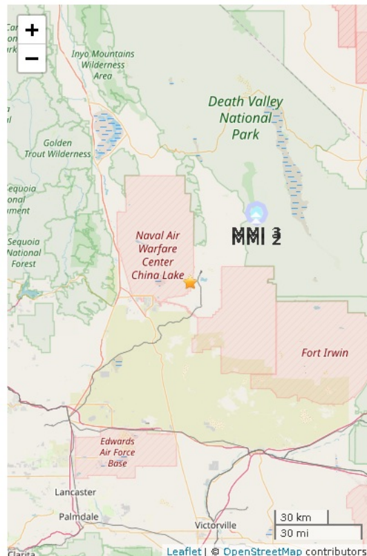
Figure 2. Polygons show shaking intensity contours for the final ShakeAlert. Shaking of intensity 3 or less is often not felt. Star shows the regional network epicenter.