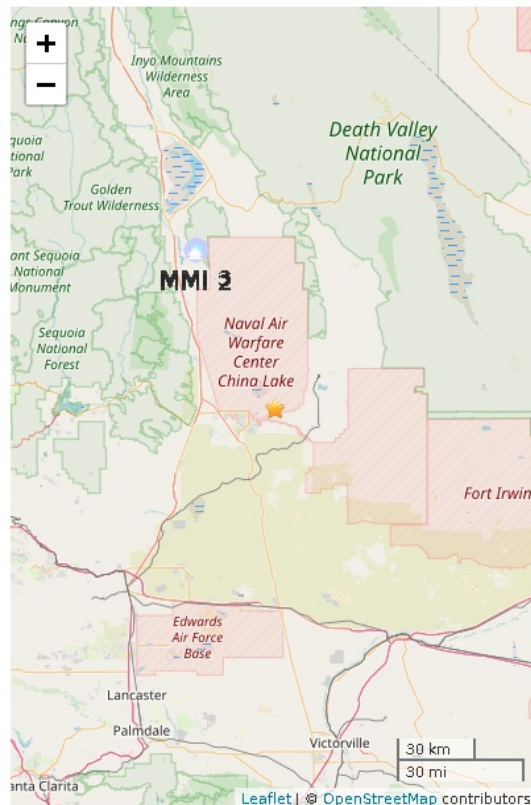
Figure 2. Polygons show shaking intensity contours for the final ShakeAlert. Shaking of intensity 3 or less is often not felt. Star shows the regional network epicenter.