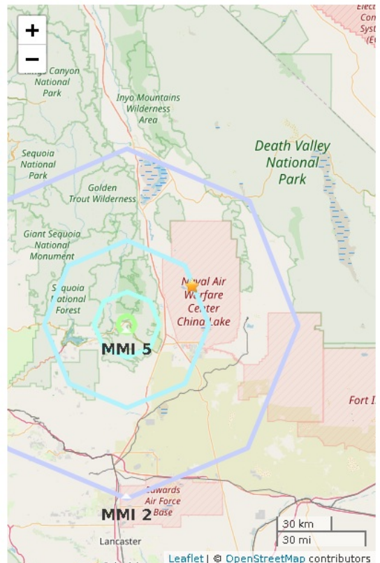
Figure 2. Polygons show shaking intensity contours for the final ShakeAlert. Shaking of intensity 3 or less is often not felt. Star shows the regional network epicenter.

Report created 2019-07-25 17:47:56 (Pacific)