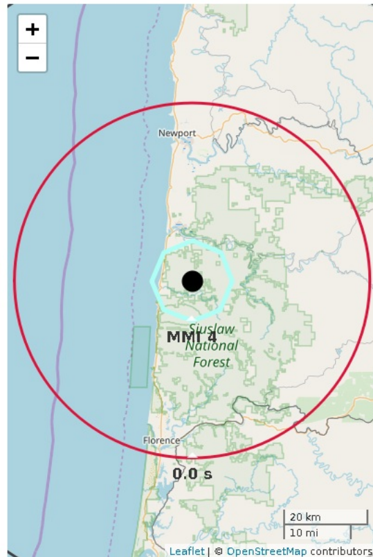
Figure 1. ShakeAlert initial earthquake location (black dot). Regional network epicenter not available. Polygon is the predicted outer range for felt ground motion (MMI 2). Red circle is front of peak shaking when the alert was released. Shaking takes 10 s to expand from circle to circle.

To learn more about ShakeAlert®, visit www.shakealert.org/FAQ