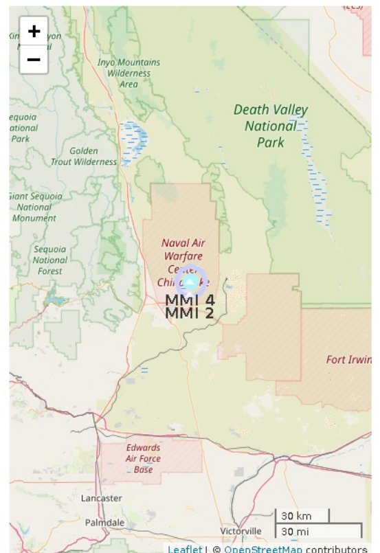
Figure 2. Polygons show shaking intensity contours for the final ShakeAlert. Shaking of intensity 3 or less is often not felt. Regional network epicenter not available.

Report created 2019-10-10 16:11:11 (Pacific)