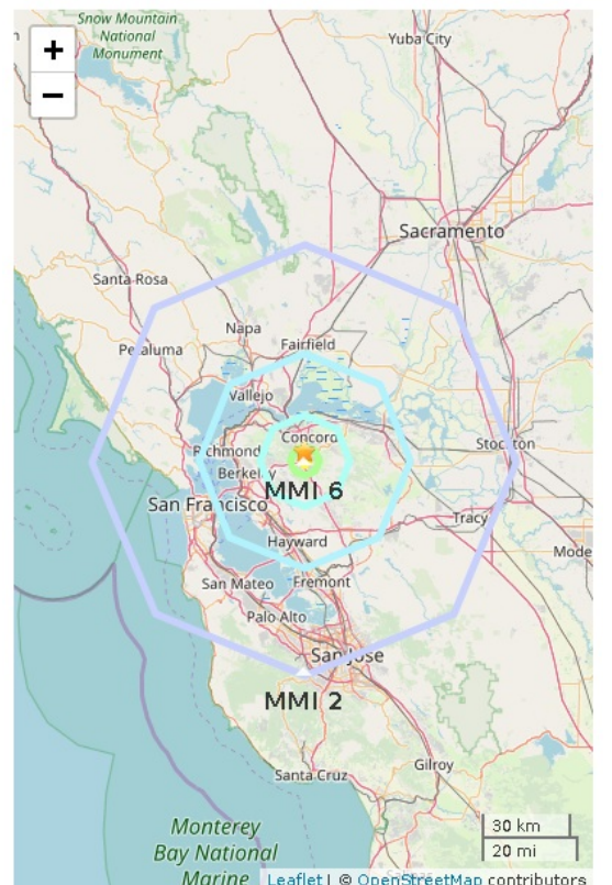
Figure 2. Polygons show shaking intensity contours for the final ShakeAlert. Shaking of intensity 3 or less is often not felt. Star shows the regional network epicenter.

Report created 2019-10-14 22:38:50 (Pacific)