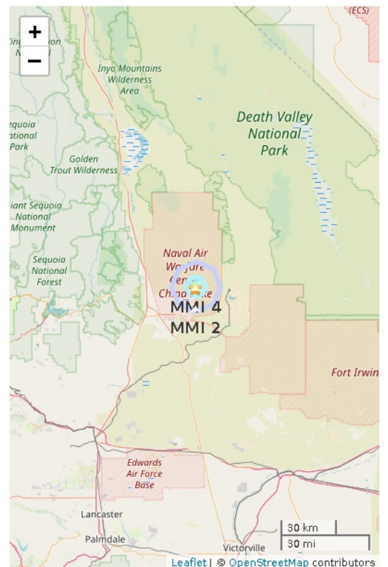
Figure 2. Polygons show shaking intensity contours for the final ShakeAlert. Shaking of intensity 3 or less is often not felt. Star shows the regional network epicenter.

Report created 2019-10-17 22:40:03 (Pacific)