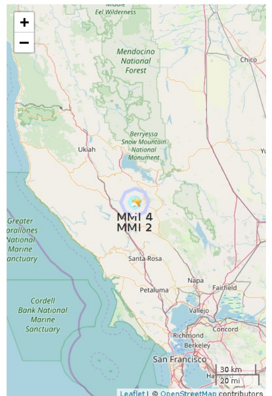
Figure 2. Polygons show shaking intensity contours for the final ShakeAlert. Shaking of intensity 3 or less is often not felt. Star shows the regional network epicenter.

Report created 2019-11-02 07:40:48 (Pacific)