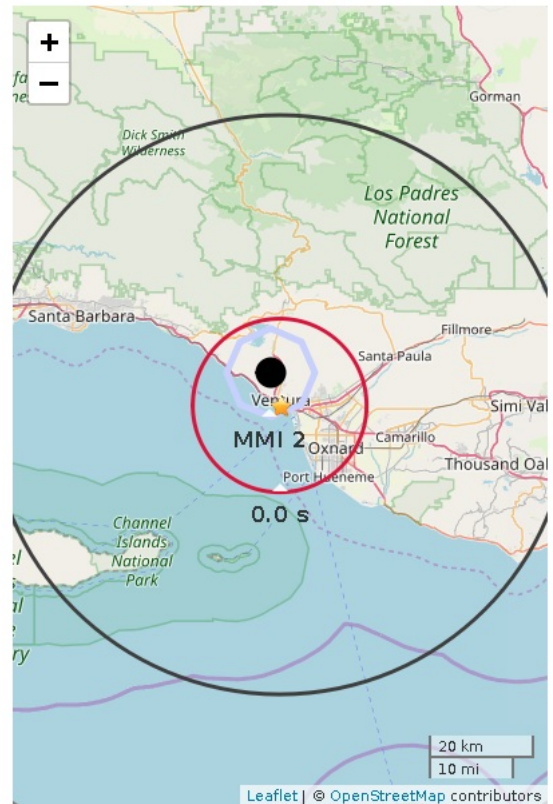
Figure 1. ShakeAlert initial earthquake location (black dot). Star is regional network epicenter. Polygon is the predicted outer range for felt ground motion (MMI 2). Red circle is front of peak shaking when the alert was released. Shaking takes 10 s to expand from circle to circle.

To learn more about ShakeAlert®, visit www.shakealert.org/FAQ