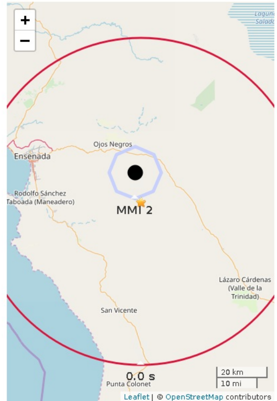
Figure 1. ShakeAlert initial earthquake location (black dot). Star is regional network epicenter. Polygon is the predicted outer range for felt ground motion (MMI 2). Red circle is front of peak shaking when the alert was released. Shaking takes 10 s to expand from circle to circle.

To learn more about ShakeAlert®, visit www.shakealert.org/FAQ