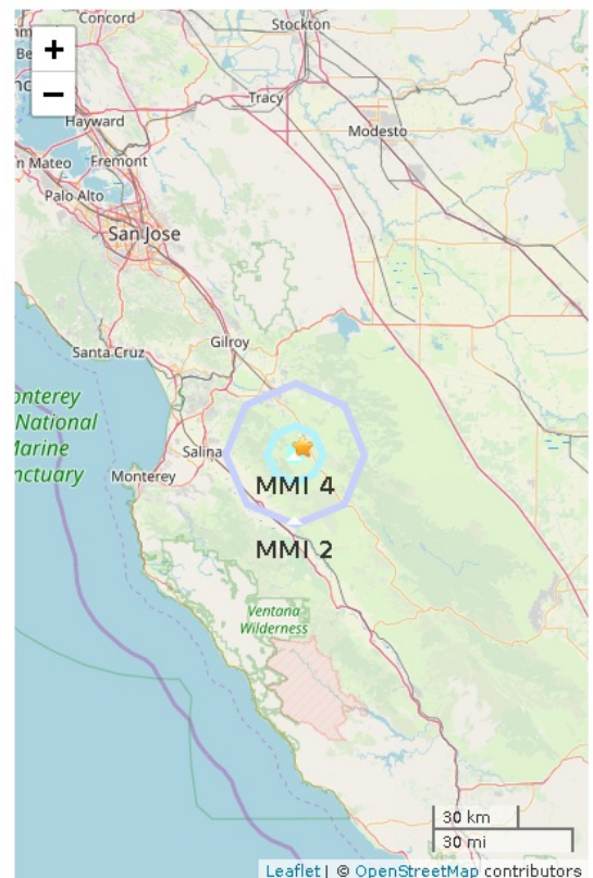
Figure 2. Polygons show shaking intensity contours for the final ShakeAlert. Shaking of intensity 3 or less is often not felt. Star shows the regional network epicenter.

Report created 2020-02-12 19:38:49 (Pacific)