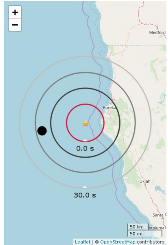
Figure 1. ShakeAlert initial earthquake location (black dot). Star is regional network epicenter. MMI 4 polygon is the estimated initial alert area. Red circle is front of peak shaking when the alert was released. Shaking takes 10 s to expand from circle to circle.

To learn more about ShakeAlert®, visit www.shakealert.org/FAQ