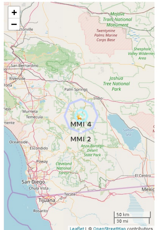
Figure 2. Polygons show shaking intensity contours for the final ShakeAlert. Shaking of intensity 3 or less is often not felt. Star shows the regional network epicenter.