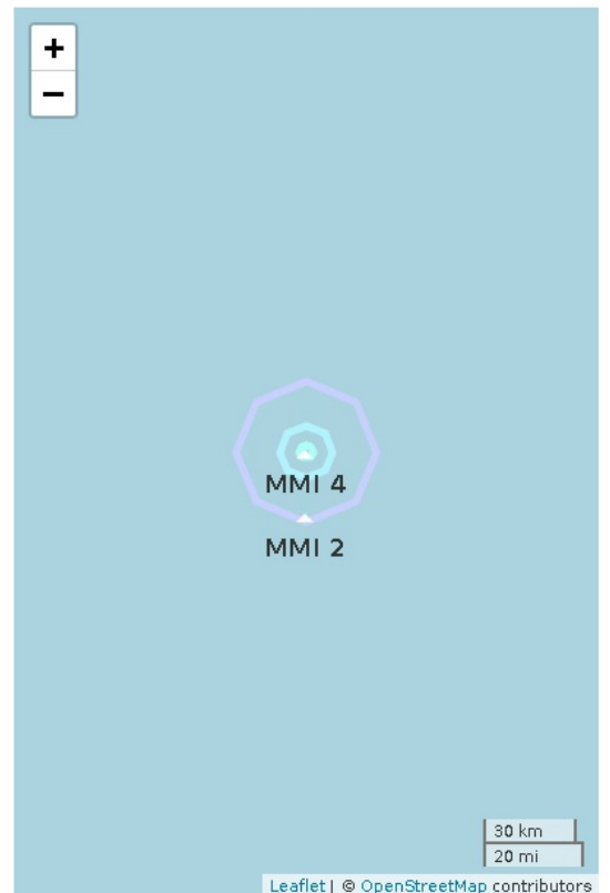
Figure 2. Polygons show shaking intensity contours for the final ShakeAlert. Shaking of intensity 3 or less is often not felt. Regional network epicenter not available.