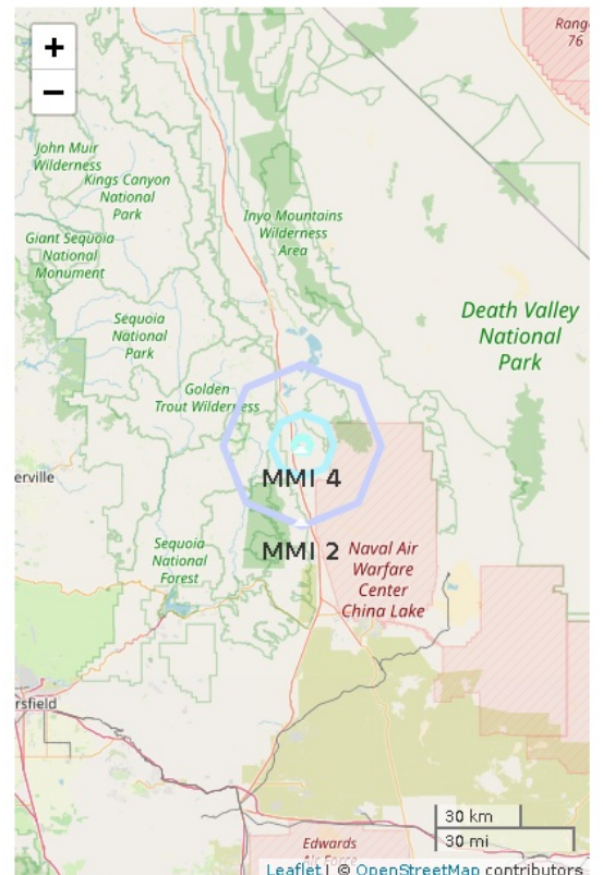
Figure 2. Polygons show shaking intensity contours for the peak magnitude ShakeAlert. Shaking of intensity 3 or less is often not felt. Regional network epicenter not available.