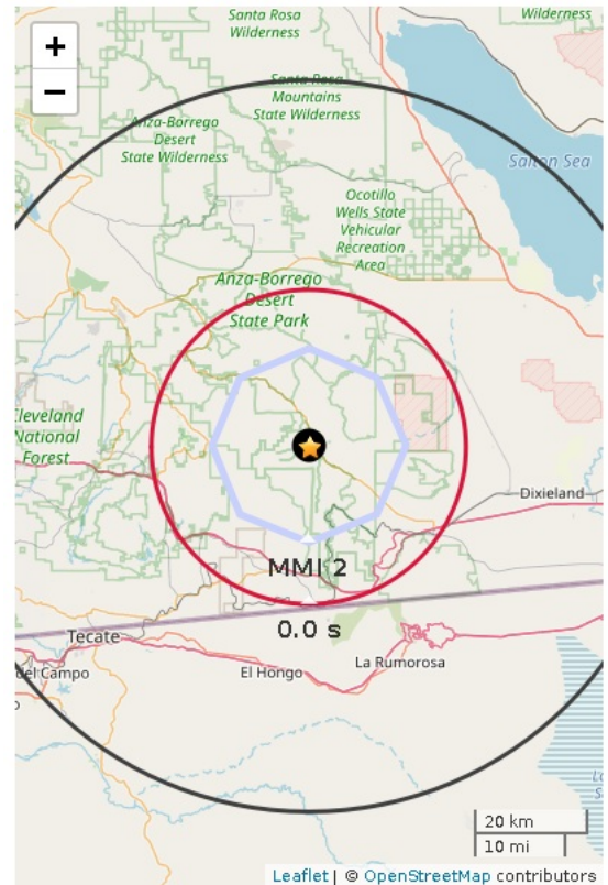
Figure 1. ShakeAlert initial earthquake location (black dot). Star is regional network epicenter. Polygon is the predicted outer range for felt ground motion (MMI 2). Red circle is front of peak shaking when the alert was released. Shaking takes 10 s to expand from circle to circle.

To learn more about ShakeAlert®, visit www.shakealert.org/FAQ