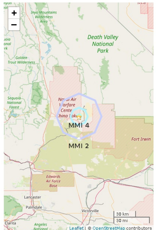
Figure 2. Polygons show shaking intensity contours for the peak magnitude ShakeAlert. Shaking of intensity 3 or less is often not felt. Star shows the regional network epicenter.

Report created 2020-08-21 01:25:16 (Pacific)