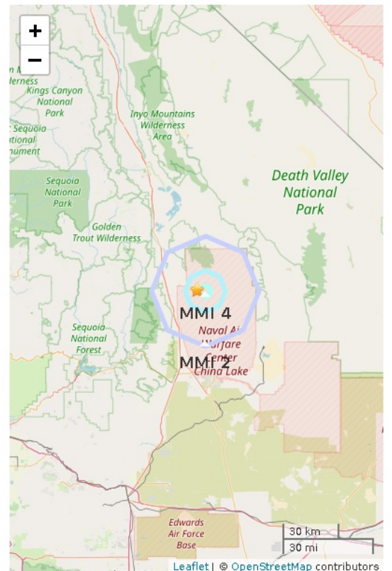
Figure 2. Polygons show shaking intensity contours for the peak magnitude ShakeAlert. Shaking of intensity 3 or less is often not felt. Star shows the regional network epicenter.