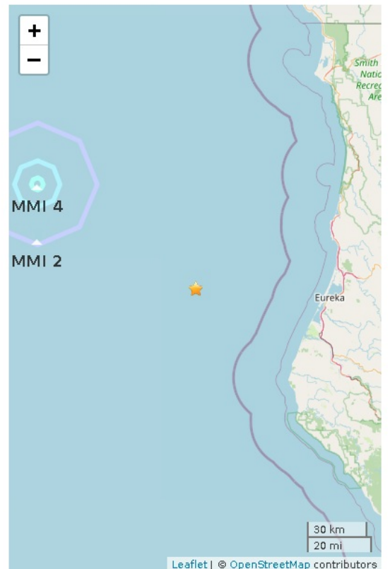
Figure 2. Polygons show shaking intensity contours for the peak magnitude ShakeAlert. Shaking of intensity 3 or less is often not felt. Star shows the regional network epicenter.

Report created 2020-12-01 22:28:01 (Pacific)