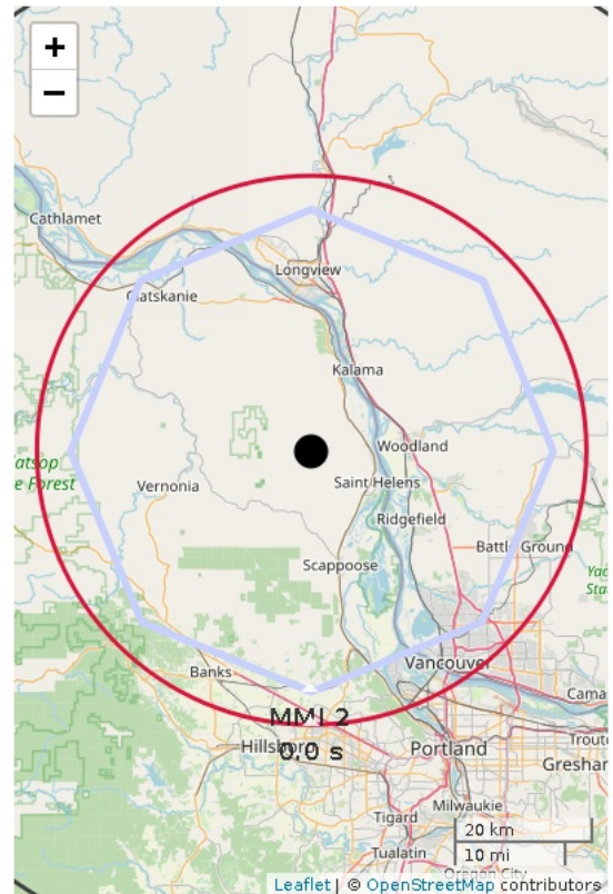
Figure 1. ShakeAlert initial earthquake location (black dot). Regional network epicenter not available. Polygon is the predicted outer range for felt ground motion (MMI 2). Red circle is front of peak shaking when the alert was released. Shaking takes 10 s to expand from circle to circle.

To learn more about ShakeAlert®, visit www.shakealert.org/FAQ