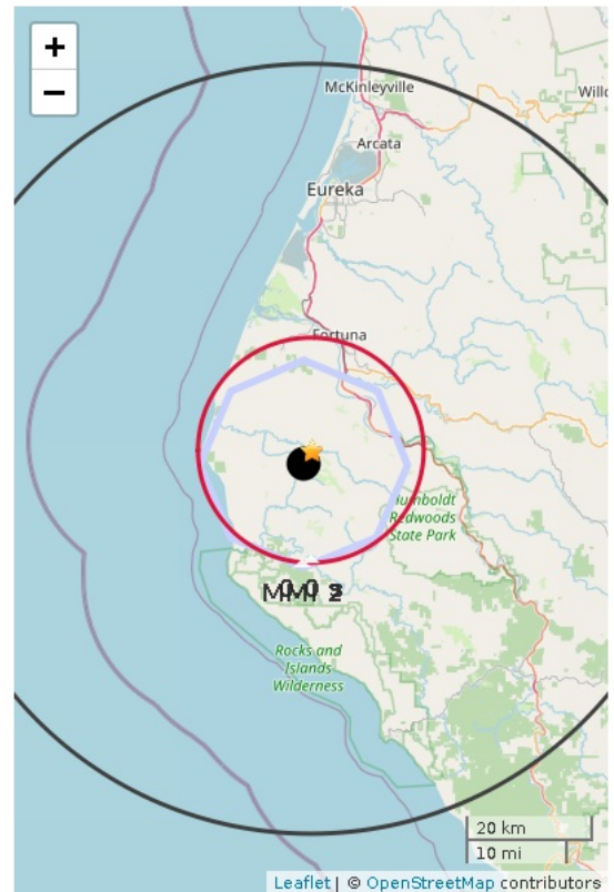
Figure 1. ShakeAlert initial earthquake location (black dot). Star is regional network epicenter. Polygon is the predicted outer range for felt ground motion (MMI 2). Red circle is front of peak shaking when the alert was released. Shaking takes 10 s to expand from circle to circle.

To learn more about ShakeAlert®, visit www.shakealert.org/FAQ