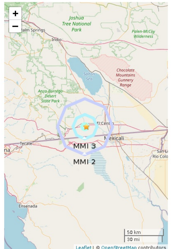
Figure 2. Polygons show shaking intensity contours for the peak magnitude ShakeAlert. Shaking of intensity 3 or less is often not felt. Star shows the regional network epicenter.