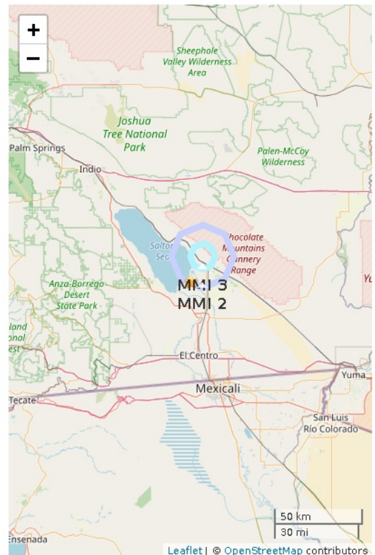
Figure 2. Polygons show shaking intensity contours for the peak magnitude ShakeAlert. Shaking of intensity 3 or less is often not felt. Star shows the regional network epicenter.