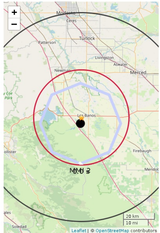
Figure 1. ShakeAlert initial earthquake location (black dot). Star is regional network epicenter. Polygon is the approximate outer range for felt ground motion. If shown***, red circle is front of peak shaking when the alert was released. Shaking takes 10 s to expand from circle to circle.

To learn more about ShakeAlert®, visit www.shakealert.org/FAQ