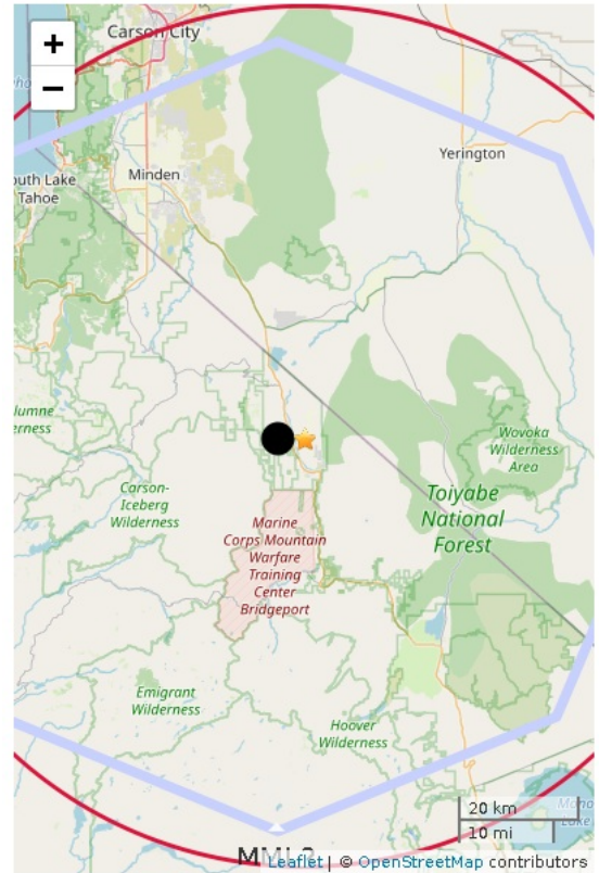
Figure 1. ShakeAlert initial earthquake location (black dot). Star is regional network epicenter. Polygon is the approximate outer range for felt ground motion. If shown***, red circle is front of peak shaking when the alert was released. Shaking takes 10 s to expand from circle to circle.

To learn more about ShakeAlert®, visit www.shakealert.org/FAQ