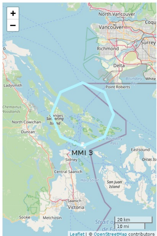
Figure 2. Polygons show shaking intensity contours for the peak magnitude estimate. Shaking of MMI 3 or less is often not felt. ANSS earthquake epicenter not available.