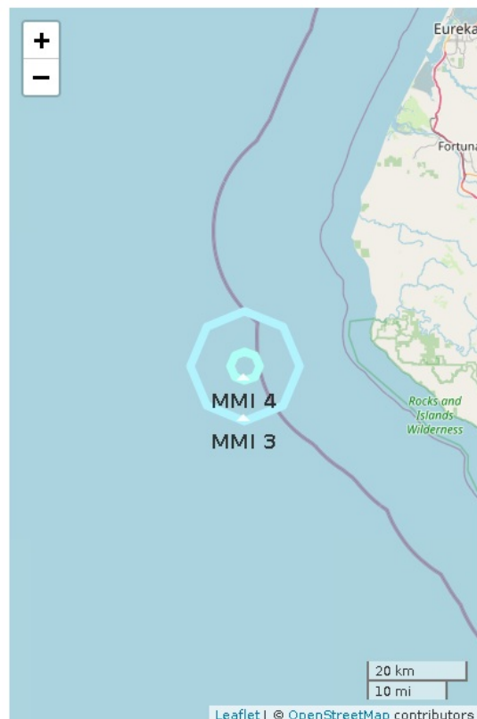
Figure 2. Polygons show shaking intensity contours for the peak magnitude estimate. Shaking of MMI 3 or less is often not felt. ANSS earthquake epicenter not available.