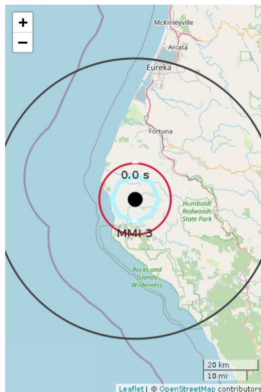
Figure 1. ShakeAlert initial earthquake location (black dot). ANSS earthquake epicenter not available. Polygon approximates outer range for felt ground motion. If shown, red circle is front of peak shaking when the message was released***. Shaking takes 10 s to expand from circle to circle.

This information is provisional and subject to revision. It is being provided to meet the need for timely best science. The information has not received final approval by the U.S. Geological Survey (USGS) and is provided on the condition that neither the USGS nor the U.S. Government shall be held liable for any damages resulting from the authorized or unauthorized use of the information.