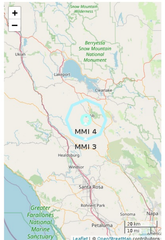
Figure 2. Polygons show shaking intensity contours for the peak magnitude estimate. Shaking of MMI 3 or less is often not felt. ANSS earthquake epicenter not available.