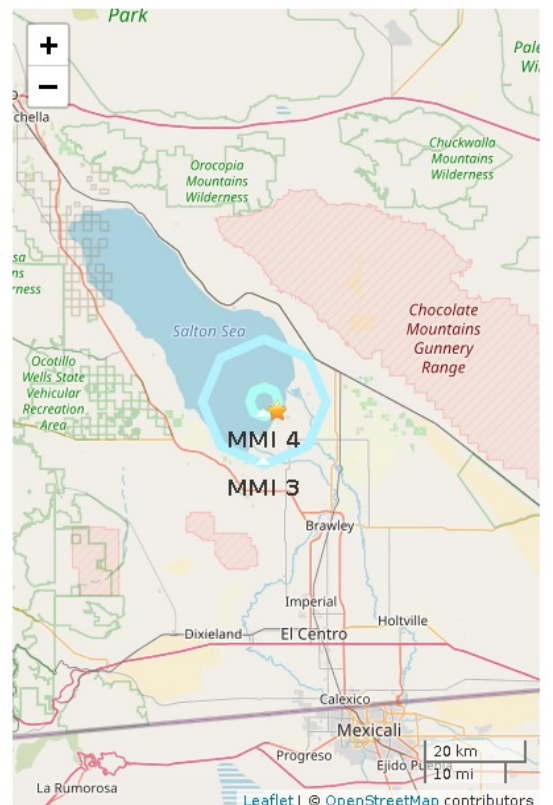
Figure 2. Polygons show shaking intensity contours for the peak magnitude estimate. Shaking of MMI 3 or less is often not felt. Star shows the ANSS earthquake epicenter.