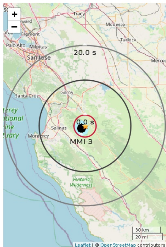
Figure 1. ShakeAlert initial earthquake location (black dot). Star is ANSS earthquake epicenter. Polygon approximates the outer range for felt ground motion. If shown, red circle is front of peak shaking when the message was released***. Shaking takes 10 s to expand from circle to circle.

To learn more about ShakeAlert®, visit www.shakealert.org/FAQ