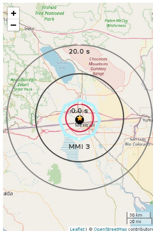
Figure 1. ShakeAlert initial earthquake location (black dot). Star is ANSS earthquake epicenter. Polygon approximates the outer range for felt ground motion. If shown, red circle is front of peak shaking when the message was released***. Shaking takes 10 s to expand from circle to circle.

To learn more about ShakeAlert®, visit www.shakealert.org/FAQ