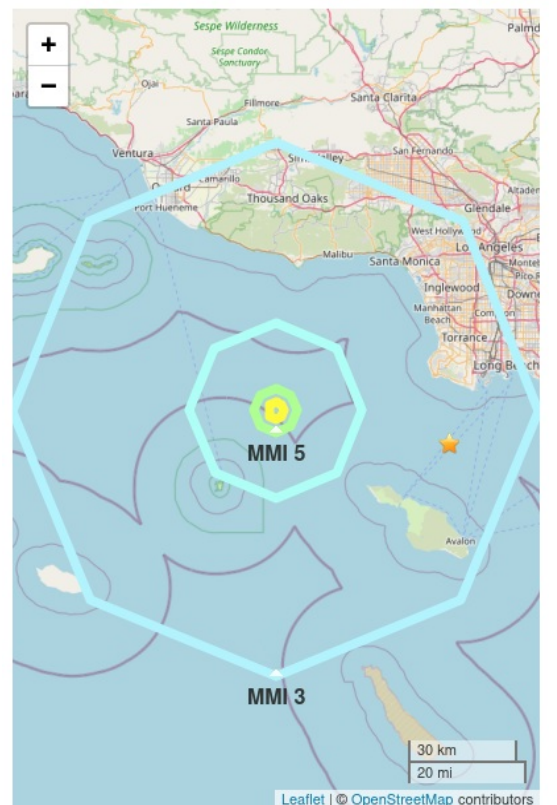
Figure 2. Polygons show shaking intensity contours for the peak magnitude estimate. Shaking of MMI 3 or less is often not felt. Star shows the ANSS earthquake epicenter.

Report created 2024-01-01 08:32:38 (Pacific)