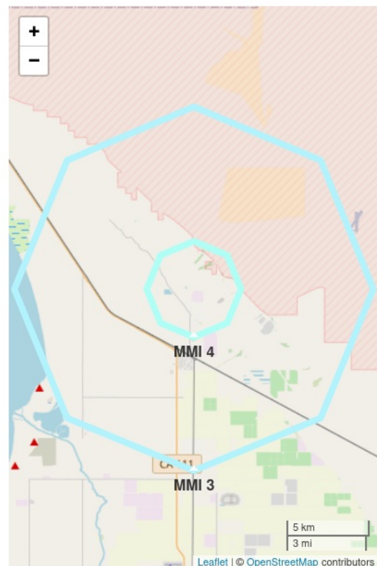
Figure 2. Polygons show the largest contours of estimated shaking intensity. Shaking of MMI 3 or less is often not felt. Star shows the ANSS earthquake epicenter.

Report created 2025-04-10 01:39:09 (Pacific)