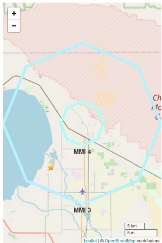
Figure 2. Polygons show the largest contours of estimated shaking intensity. Shaking of MMI 3 or less is often not felt. Star shows the ANSS earthquake epicenter.

Report created 2025-04-10 02:00:32 (Pacific)