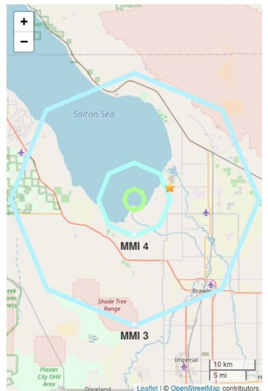
Figure 2. Polygons show the largest contours of estimated shaking intensity. Shaking of MMI 3 or less is often not felt. Star shows the ANSS earthquake epicenter.

Report created 2025-04-10 19:57:22 (Pacific)