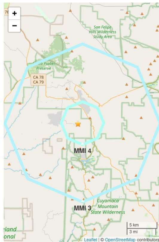
Figure 2. Polygons show the largest contours of estimated shaking intensity. Shaking of MMI 3 or less is often not felt. Star shows the ANSS earthquake epicenter.

Report created 2025-04-14 11:28:47 (Pacific)