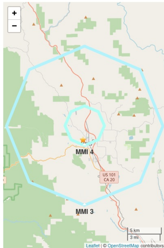
Figure 2. Polygons show the largest contours of estimated shaking intensity. Shaking of MMI 3 or less is often not felt. Star shows the ANSS earthquake epicenter.

Report created 2025-05-01 14:25:48 (Pacific)