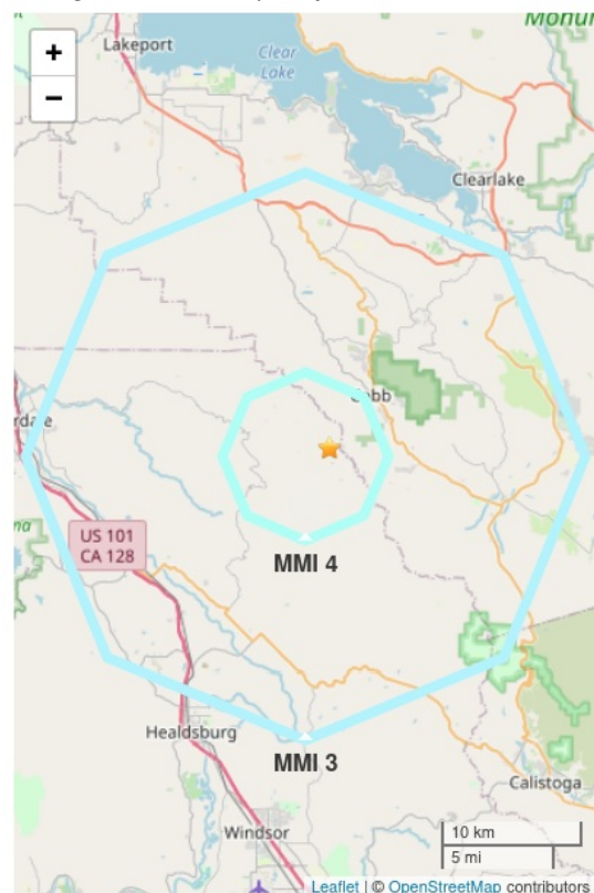
Figure 2. Polygons show the largest contours of estimated shaking intensity. Shaking of MMI 3 or less is often not felt. Star shows the ANSS earthquake epicenter.

Report created 2025-05-02 17:40:23 (Pacific)