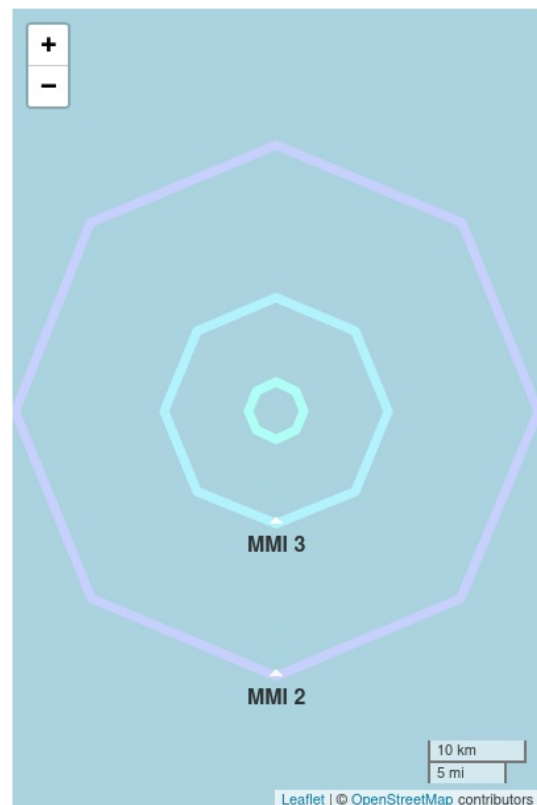
Figure 2. Polygons show the largest contours of estimated shaking intensity. Shaking of MMI 3 or less is often not felt. ANSS earthquake epicenter not available.

Report created 2025-06-20 00:55:00 (Pacific)