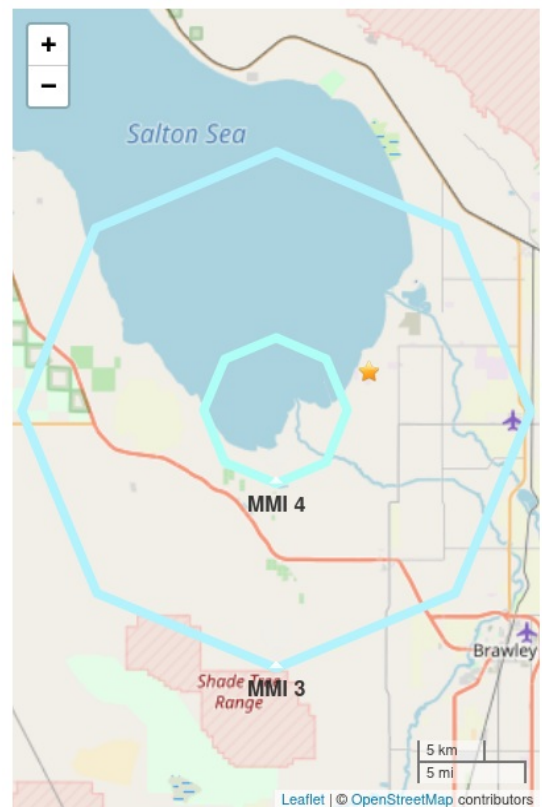
Figure 2. Polygons show the largest contours of estimated shaking intensity. Shaking of MMI 3 or less is often not felt. Star shows the ANSS earthquake epicenter.

Report created 2025-07-11 01:27:42 (Pacific)