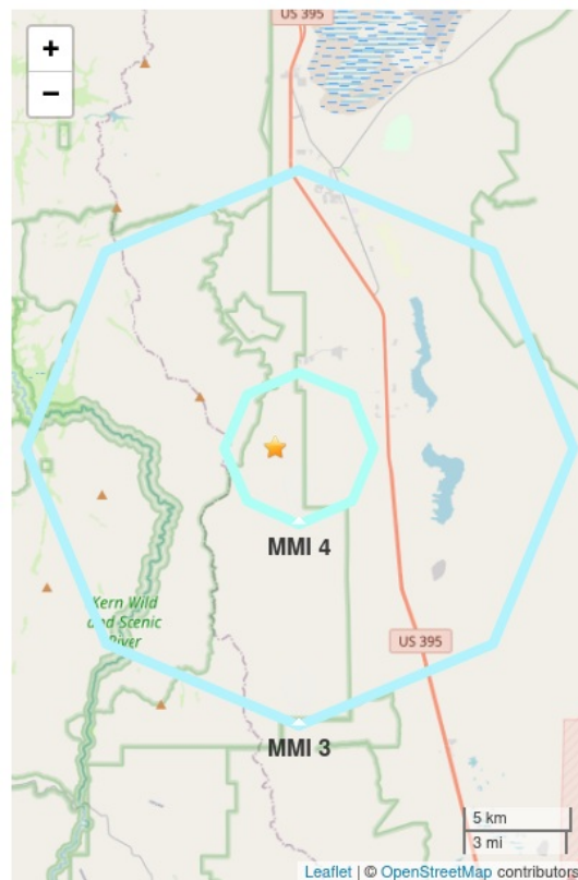
Figure 2. Polygons show the largest contours of estimated shaking intensity. Shaking of MMI 3 or less is often not felt. Star shows the ANSS earthquake epicenter.

Report created 2025-07-13 05:33:01 (Pacific)