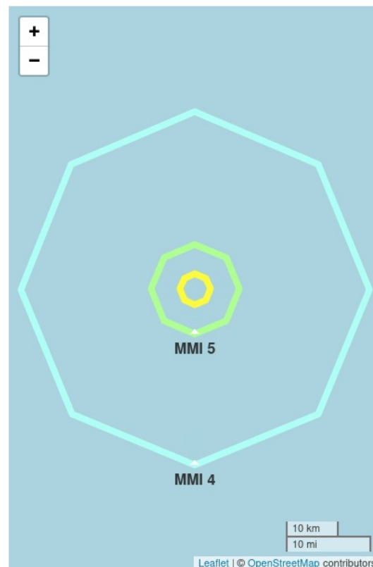
Figure 2. Polygons show the largest contours of estimated shaking intensity. Shaking of MMI 3 or less is often not felt. Star shows the ANSS earthquake epicenter.

Report created 2025-07-29 16:23:35 (Pacific)