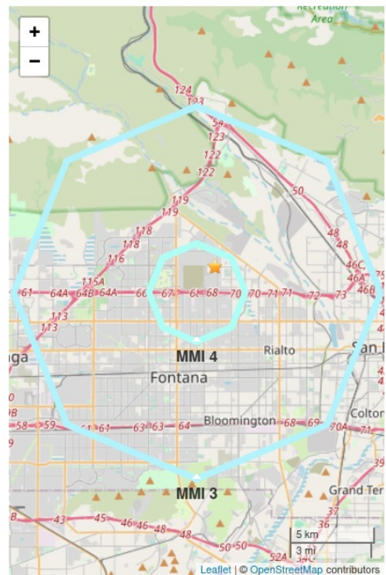
Figure 2. Polygons show the largest contours of estimated shaking intensity. Shaking of MMI 3 or less is often not felt. Star shows the ANSS earthquake epicenter.

Report created 2025-08-05 16:59:43 (Pacific)