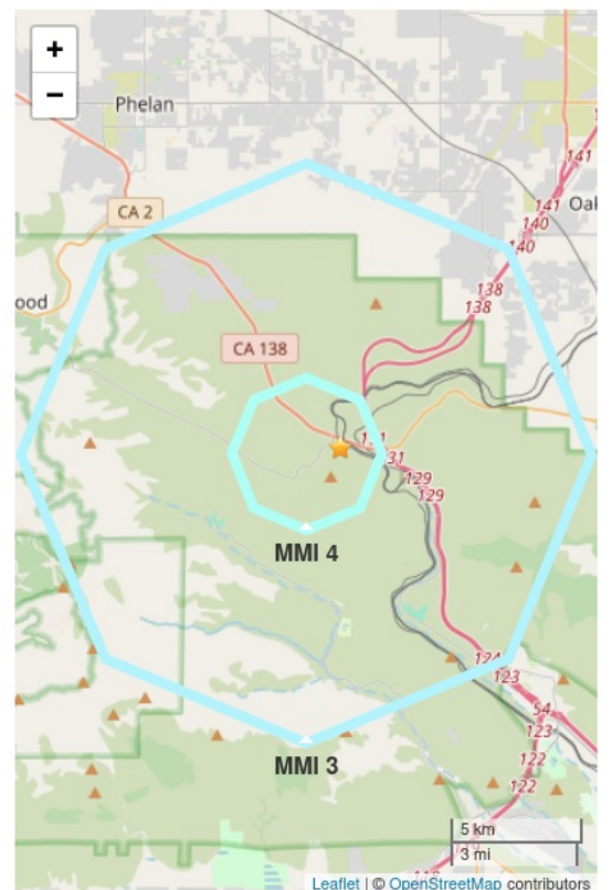
Figure 2. Polygons show the largest contours of estimated shaking intensity. Shaking of MMI 3 or less is often not felt. Star shows the ANSS earthquake epicenter.

Report created 2025-08-06 02:05:57 (Pacific)