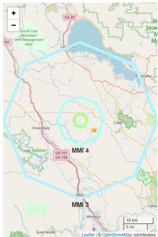
Figure 2. Polygons show the largest contours of estimated shaking intensity. Shaking of MMI 3 or less is often not felt. Star shows the ANSS earthquake epicenter.

Report created 2025-08-14 05:53:09 (Pacific)