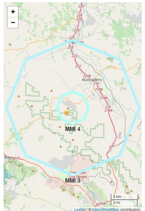
Figure 2. Polygons show the largest contours of estimated shaking intensity. Shaking of MMI 3 or less is often not felt. Star shows the ANSS earthquake epicenter.

Report created 2025-09-13 19:55:06 (Pacific)